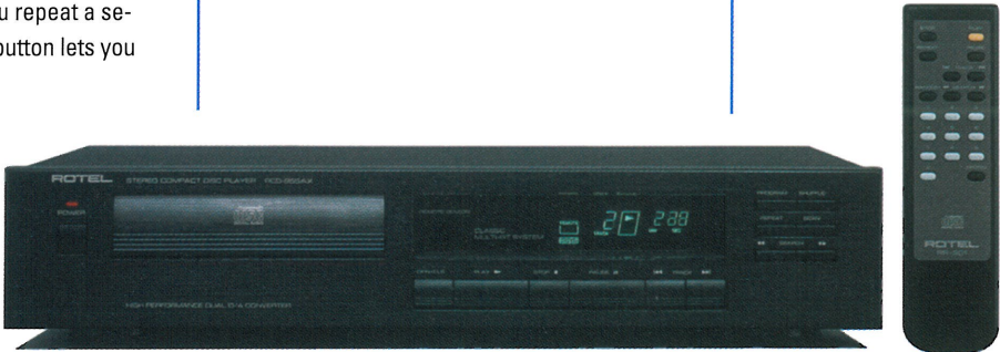
RCD 955AX disc player

RCD955AX. The RCD955AX has received consistently lavish praise for its musical neutrality and its uncanny ability to recreate a convincing three-dimensional soundstage. The respected International Audio Review said, "You can get slightly better CD sound elsewhere, but only by spending a lot more money. At its price, nothing else we've heard even comes close."