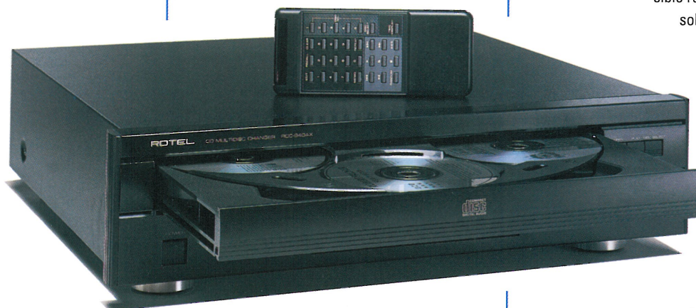
RCC 940AX Disc Changer

From affordable CD players, to convenient disc changers, to esoteric high end players, Rotel offers high performance digital components that capture the essence of the original musical performance.