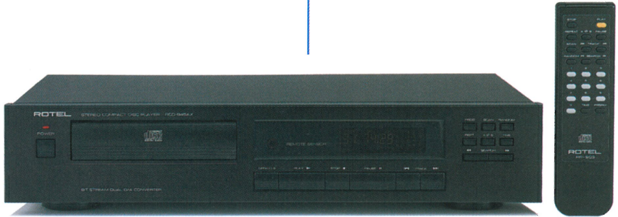
RCD 945AX disc player

Despite its low price, the RCD945AX offers a full array of controls as well as several features for added convenience. Its repeat functions allow you to continuously repeat the entire disc, a selected program, or just a single track. The introscan feature plays the first five seconds of each track on the disc or in a selected program. The A-B repeat function lets you repeat a selected passage. And the 'time' button lets you view your choice of elapsed track time, program elapsed time, or remaining disc time. All in all, the RCD945AX 's impressive sound quality, versatile control functions, and price make it today's best bargain in affordable high end CD players.