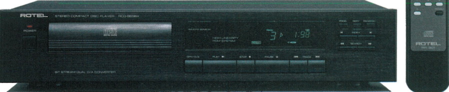
RCD 965LE disc player

RCD955AX. The RCD955AX has received consistently lavish praise for its musical neutrality and its uncanny ability to recreate a convincing three-dimensional soundstage. The respected International Audio Review said, "You can get slightly better CD sound elsewhere, but only by spending a lot more money. At its price, nothing else we've heard even comes close."