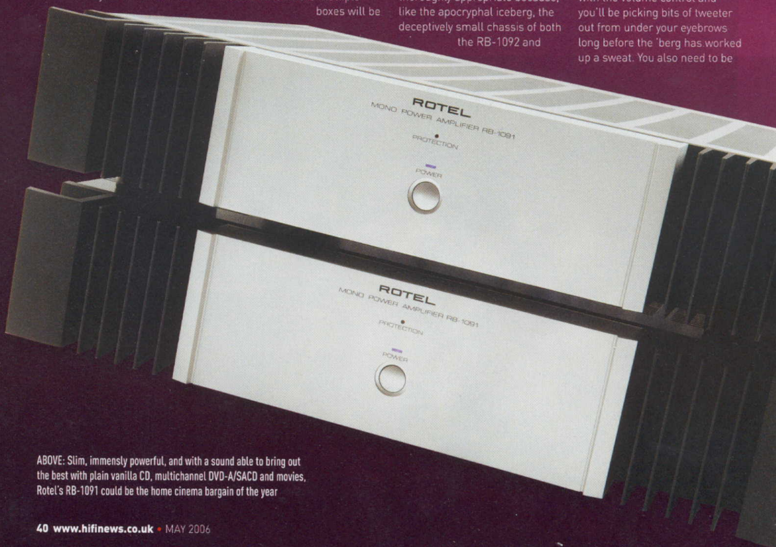
ABOVE: Slim, immensely powerful, and with a sound able to bring out the best with plain vanilla CD, multichannel DVD-A/SACD and movies, Rotel's RB-1091 could be the home cinema bargain of the year

RB-1091 amplifiers is no real indication of their hidden depths. Hook either amplifier into almost any speaker, play fast and loose with the volume control and you'll be picking bits of tweeter out from under your eyebrows long before the 'berg has worked up a sweat. You also need to be